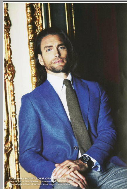
ROLEX ROYAL OAK DATEPIECE Material: carbon fibre Diameter: 40mm Movement: automatic, calibre 2715 Power reserve: 60 hours Functions: hours, minutes, seconds, date

KNUT. HEIGHT: 186 BUST: 107 WAIST: 86 HIPS: 89 SIZE: 50 SHOES: 44 HAIR: ASH BLOND EYES: GREYISH BLUE