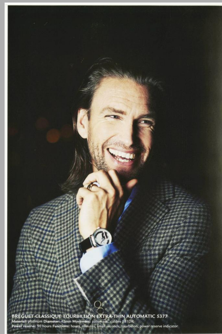
BREGUET CLASSIQUE TOURBILLON EXTRA THIN AUTOMATIC 5377 Material: platinum Diameter: 42mm Movement: automatic, calibre 581DR Power reserve: 90 hours Functions: hours, minutes, small seconds, tourbillon, power reserve indicator